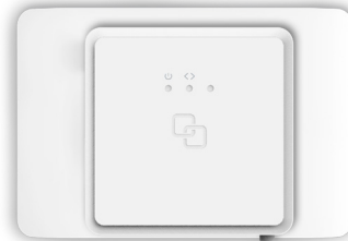
Top cover with FiberTwist ONT